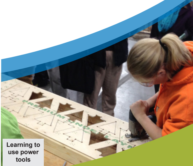
Learning to use power tools

The interactive exhibits are engaging for all ages. Interested sophomores, juniors, seniors and their parents are also invited to attend during regular exhibition hours.